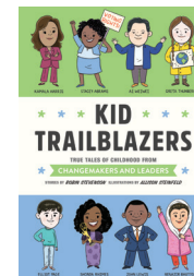
Kid Trailblazers ISBN: 978-1-68369-301-7