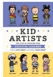
Kid Artists ISBN: 978-1-59474-896-7