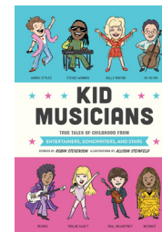
Kid Musicians *Coming Fall 2024 ISBN: 978-1-68369-391-8