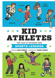
Kid Athletes ISBN: 978-1-59474-802-8