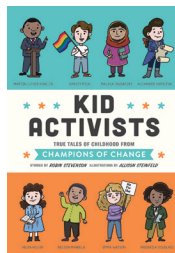
Kid Activists ISBN: 978-1-68369-141-9