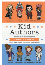
Kid Authors ISBN: 978-1-59474-987-2