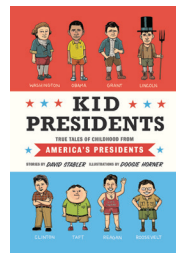
Kid Presidents ISBN: 978-1-59474-731-1