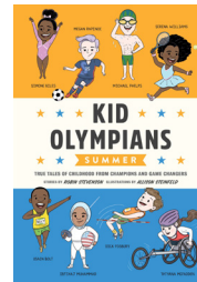
Kid Olympians: Summer ISBN: 978-1-68369-371-0